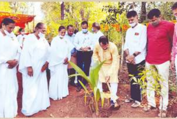
Ponda (Goa): Mr.Shripad Yesso Naik, Union Minister of State for Tourism and Ports is planting a tree after laying the foundation stone of BK centre along with BK Shobha, BK Geeta and BK Surekha.