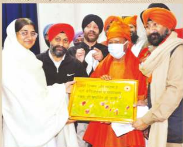
Gorkhpur: Yogi Adityanath, Chief Minister of UP is being presented Godly gift by BK Parul.