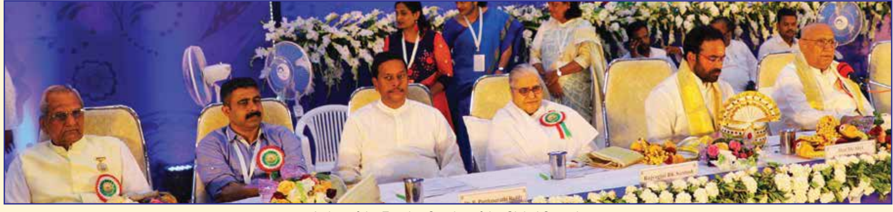
A view of the Evening Session of the Global Summit.