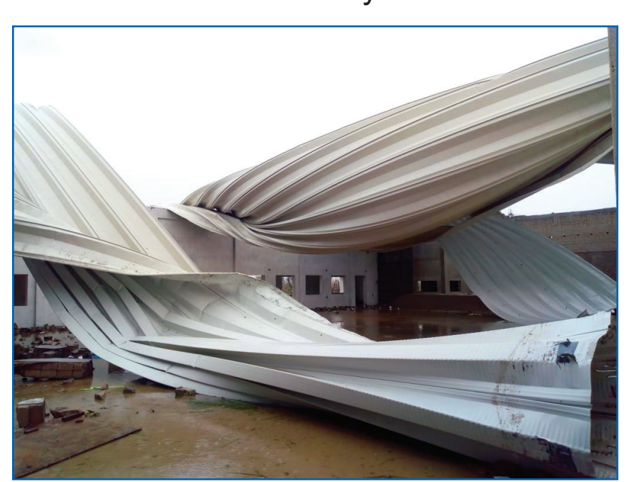
Roof of Om Shanti Auditorium, Godly Rajyoga Retreat Centre, Puri blown-off by cyclone 'Fani'.