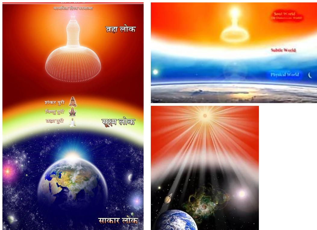
Pictures showing 3 Worlds: 3D Corporeal World (Movie-talkie world), 2D Subtle World (Movie-No talkie) and zero D Soul World

Visit our main website: www.brahma-kumaris.com | www.bkgsu.com